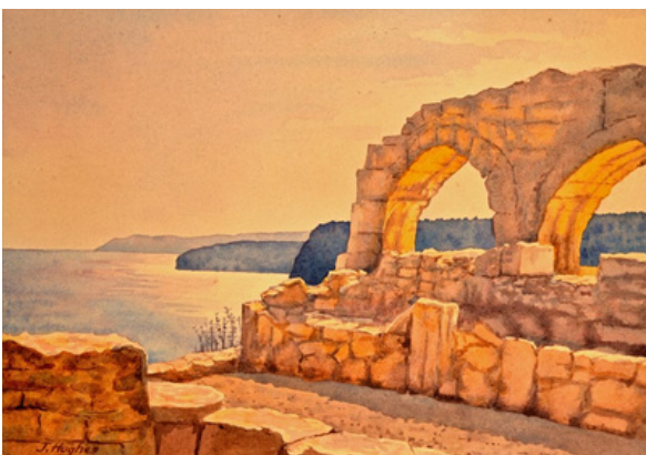
Paphos Ayia Kyriaki, 1950