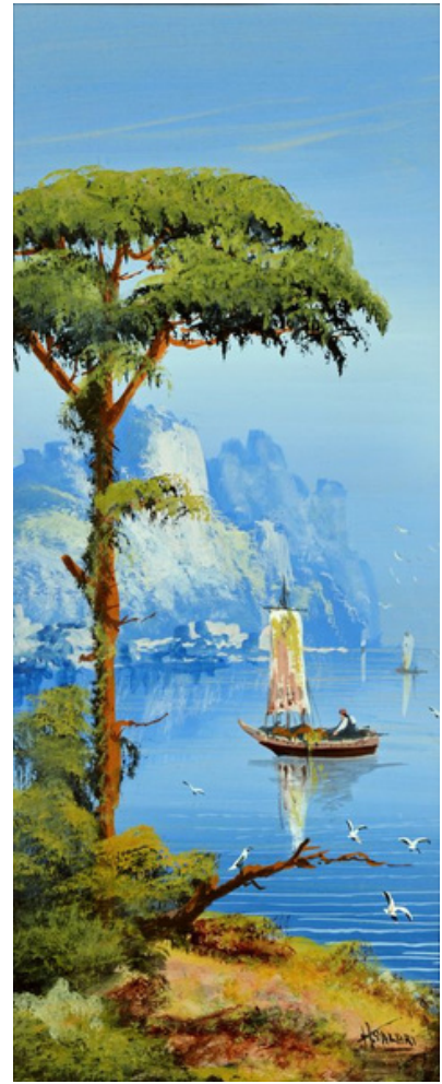
Salari H., Near Cyprus, 1900