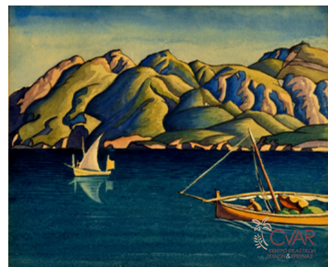
White Ethelbert, The Cyprus Coast, 1950