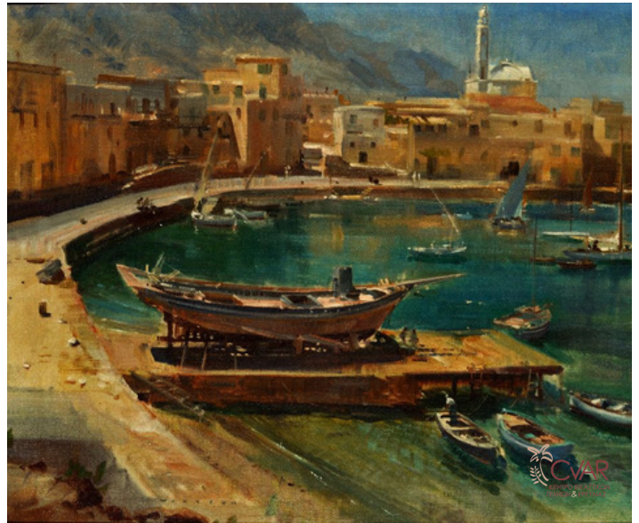
Wootton Frank, Quiet Boat Yard, 1950