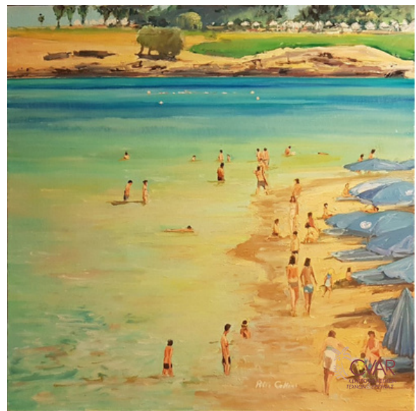
Collins Peter, Fig Tree Bay Ayia Napa